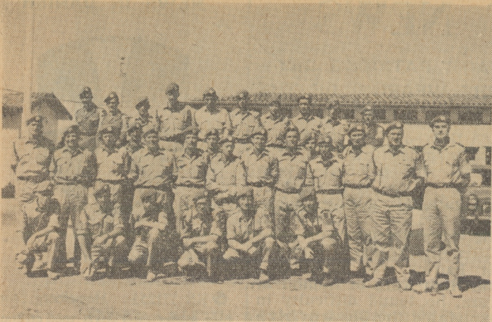
Members of the 4th Irish Infantry Group at Nicosia Airport before leaving on a weeks' tour of Lebanon and the Holy Land.