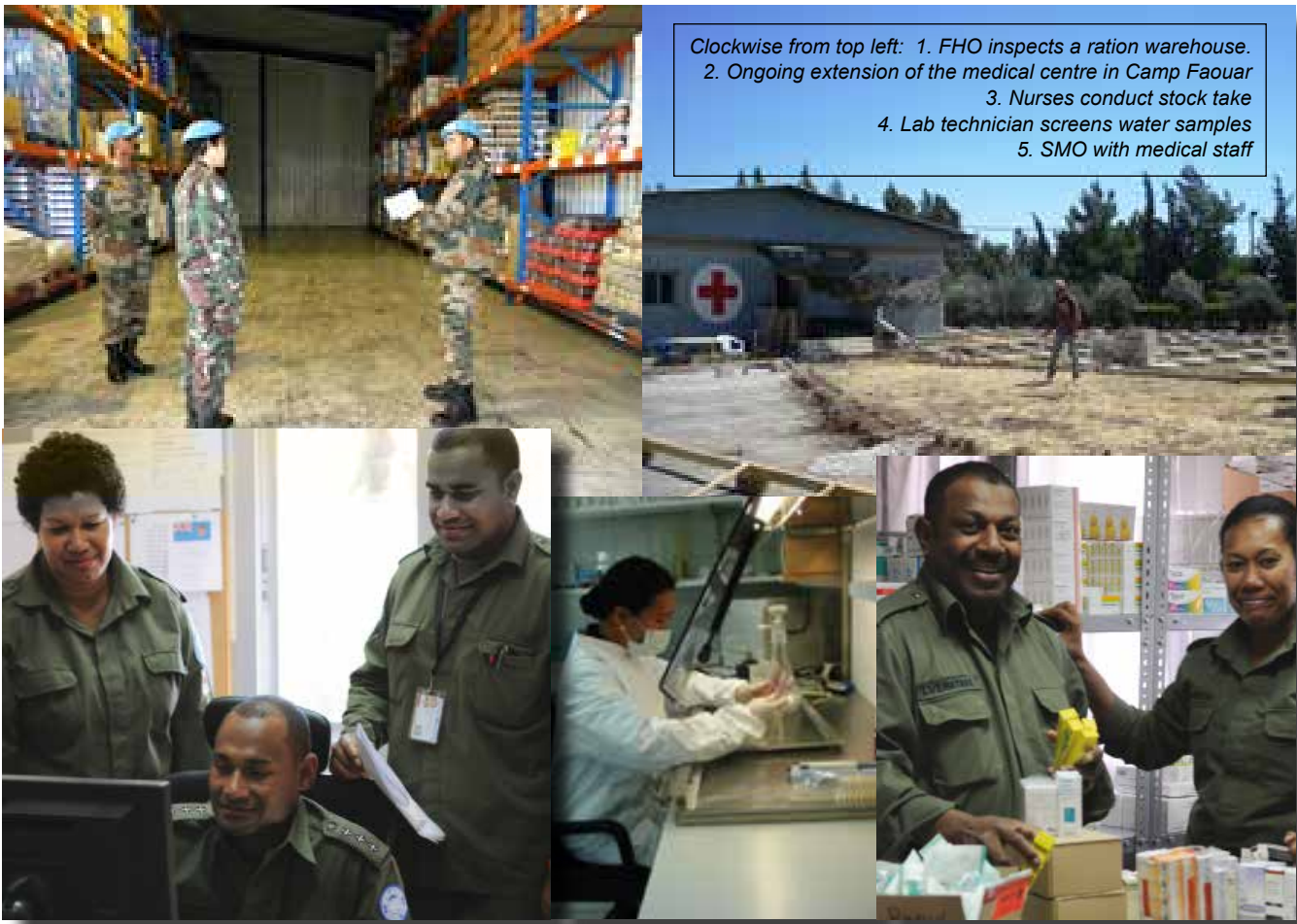
Clockwise from top left: 1. FHO inspects a ration warehouse. 2. Ongoing extension of the medical centre in Camp Faouar 3. Nurses conduct stock take 4. Lab technician screens water samples 5. SMO with medical staff