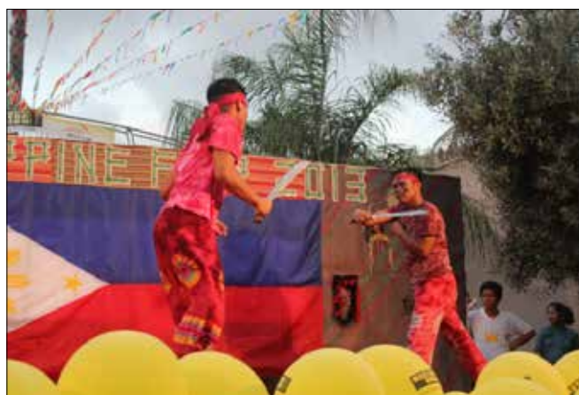
6PCGH duo performs one of the Filipino Martial Arts, Pekiti-Tirsia Kali.