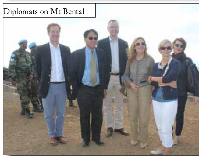
Diplomats on Mt Bental