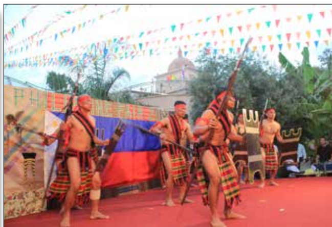
Selected members of PHILBATT perform a Cordillera War dance.