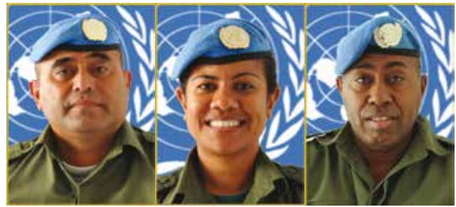
The new Editorial Staff