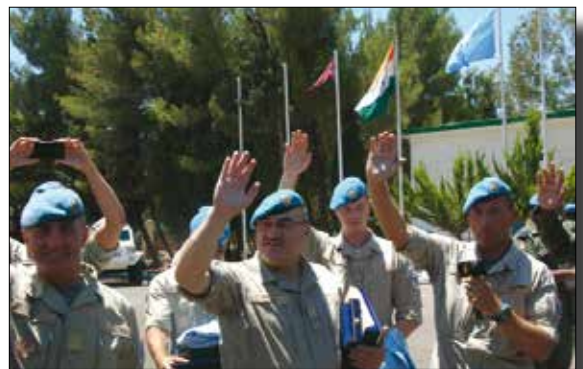
29 Jul 13 - Goodbye to the last of the Austrians!