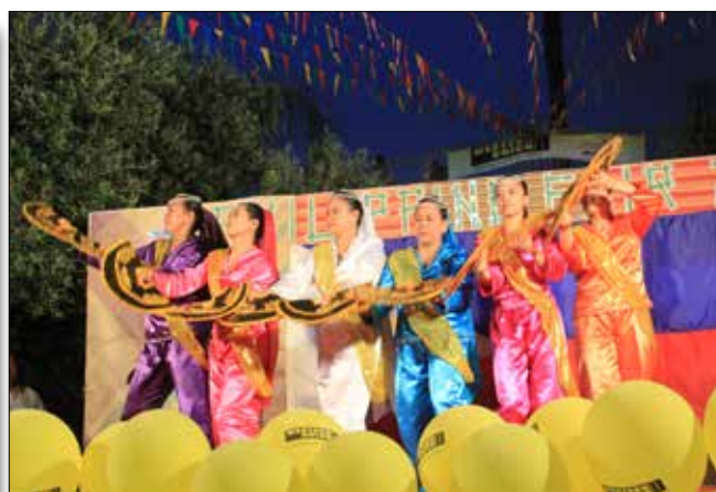
PhilBatt peacekeepers perform a muslim fan dance