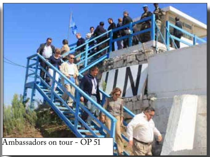
Ambassadors on tour - OP 51