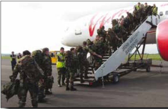
28 Sep 13 - IRECON with 115 strong pers arrived into UNDOF to takeover Force Reserve Coy.