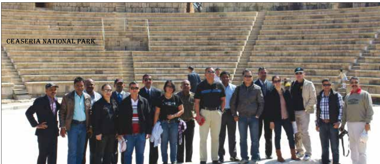
CEASERIA NATIONAL PARK

UNDOF offers sport/recreational trips to our peacekeepers to explore Syria and Israel. Both countries are rich with historical and cultural resources. However, due to crisis in Syria, we have only Israel to discover during our tour in the mission. What we missed in Syria such as the Bride of the Desert, Palmyra and the Umayyad Mosque which is one of the largest and oldest mosques in the world located in the Old City of Damascus, has been fulfilled by our trips to Israel. The vibrant and diverse history where the three religions of Judaism, Christianity and Islam crisscross in one country makes a fascinating journey to Israel. From the biggest Crusade-era castle, the Nimrod Fortress in the northern part of Golan Heights, various Holy Sites in Jerusalem, Bethlehem, Nazareth and Jericho, we were mesmerized by the love story between the sea and the mountain in Rosh Hanikra Grottoes and grandeur of Baha'i Shrine and Garden in Haifa. Indeed, we have come to embrace the beauty and peace of Israel while in UNDOF but as the eternal saying goes "THERE IS NO PLACE LIKE HOME", that is to be in the arms of our family and loved ones once again when we finally end our tour in UNDOF.