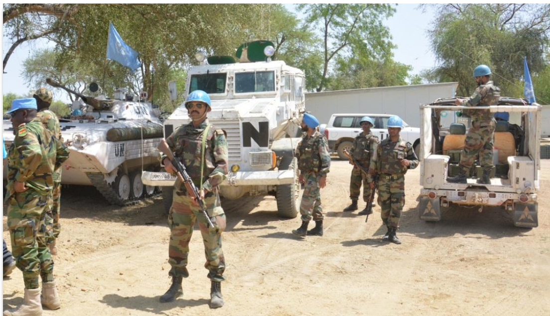
400 Indian Battalion (INDBATT) provides assistance to Bor PoC site.