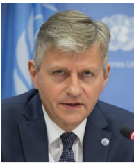
Under-Secretary-General Jean-Pierre Lacroix is the head of DPKO.

The Department of Peacekeeping Operations (DPKO) helps countries torn by conflict create the conditions for lasting peace.