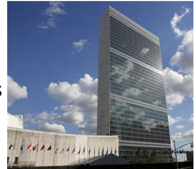
The United Nations Headquarters in New York.

UNLOPS was established in Brussels in 2011 to develop closer, more predictable and continuous partnerships between the UN and the European Union (EU), the North Atlantic Treaty Organization (NATO) and other Brussels-based organizations. UNLOPS supports institutional dialogue and improved coordination on peace and security policy, operations and programmes with a view to preventing violent conflict, managing crisis and countering terrorism. The office facilitates high level UN visits from New York and the field to Brussels, supports UN-EU and UN-NATO information exchange, and back-stops the UN-EU Steering Committee on Crisis Management, the UN-EU Partnerships Meeting on Conflict Prevention, the UN-EU Leadership Dialogue on Counter-Terrorism, and the UN-NATO Staff Talks.