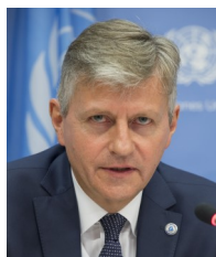
Under-Secretary-General Jean-Pierre Lacroix is the head of DPO in New York.

The Department of Peace Operations (DPO) is dedicated to assisting the Member States and the Secretary-General in their efforts to maintain international peace and security. DPO provides political and executive direction to UN peace operations around the world and maintains contact with the Security Council, troop contributing countries, and parties to the conflict in the implementation of Security Council mandates.