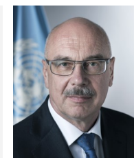
Under-Secretary-General Vladimir Voronkov is the head of the UN Office of Counter-Terrorism in New York.

The Office of Counter-Terrorism (UNOCT) was created in 2017 to ensure that due priority is given to counter-terrorism across the UN system, including the work on preventing violent extremism. The Office works to enhance the coordination and coherence of UN entities in line with the UN Global Strategy on Counter-Terrorism. UNOCT also strengthens the delivery of United Nations counter-terrorism capacity building assistance to member states.