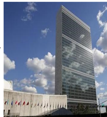
The United Nations Headquarters in New York.

The office facilitates high level UN visits from New York and the field to Brussels, supports UN-EU and UN-NATO information exchange and backstops the UN-EU Steering Committee on Crisis Management, the UN-EU Conflict Prevention Dialogue, the UN-EU Leaders' Dialogue on Counter-Terrorism, and the UN-NATO Staff Talks.