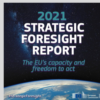
Cover of the 2021 Strategic Foresight Report