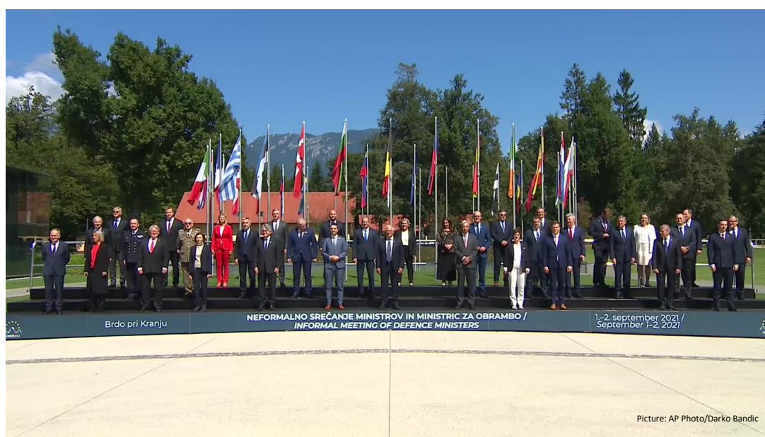
EU Defence Ministers at an informal meeting on 2 September 2021 in Kranj, discussing the Strategic Compass, with specific focus on EU operational activities in the Sahel, Libya, Mozambique and the Western Balkans.

Subsequently, on 1 September 2021, the USG travelled to Slovenia to attend the second informal meeting of EU Defence Ministers of the year, which provided a good opportunity to update Ministers on preparations for the December UN peacekeeping ministerial in Seoul. In addition to bilateral meetings with European Defence Ministers, Mr. Lacroix also met with NATO Deputy Secretary General, Mircea Geoană, to discuss UN-NATO partnership.