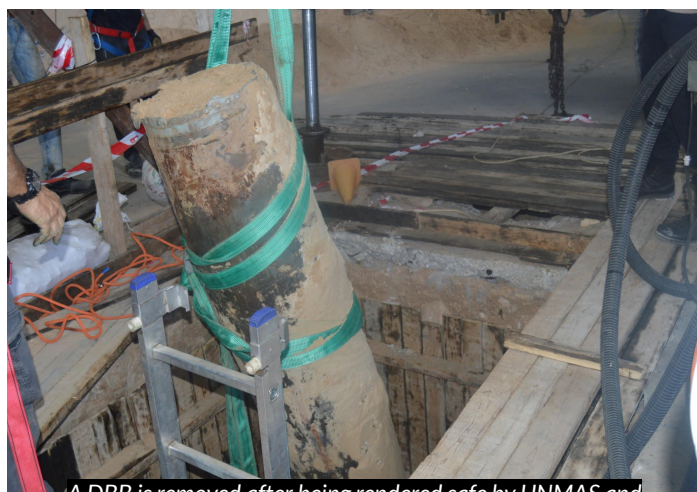
A DBB is removed after being rendered safe by UNMAS and ready for destruction.

ERW risk assessment is a systematic and investigative process involving the identification of the threat, the probability of an ERW accident, the impact of hazards on local communities, the mitigation measures that can be implemented, and the removal of the detected explosive ordnance. As part of its continued response to the May 2021 conflict, UNMAS removed a deep buried bomb (DBB), after rendering it safe, from a civilian facility in northern Gaza. The DBB was located in tile store, in a densely industrial neighbourhood with approximately 31,500 residents in the vicinity.