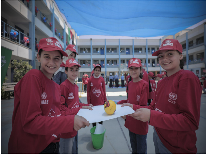
UNRWA students playing during the Safe Ground event in Beit Hanoun.

On 10 and 15 May, UNMAS and UNRWA jointly held Safe Ground events in Gaza commemorating the annual International Day for Mine Action and to ensure the children of Palestine are able to play, learn, and live free from the risk of explosive ordnance.