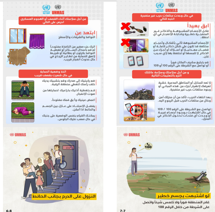
Posters and social media posts distributed in UNRWA installations and various social media platforms during the escalation in August 2022.

UNMAS has also responded to requests from UN and humanitarian partners to conduct risk assessments of their premises and operational sites to mitigate any threats posed by explosive remnants of war (ERW) contamination post-conflict.