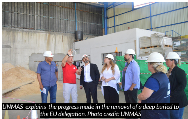
UNMAS explains the progress made in the removal of a deep buried to the EU delegation.

On 28 June 2022, a delegation from the European Union visited UNMAS operations in Gaza to see one of the deep buried bomb removal sites funded by the European Union NDICI-FPI. The UNMAS Operations Team explained the technical processes of the removal.